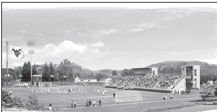
BEGINNING WITH THE 2004 SEASON, THE NEW HOME OF MOUNTAINEER MEN'S AND WOMEN'S SOCCER WILL BE DICK DLESK STADIUM.