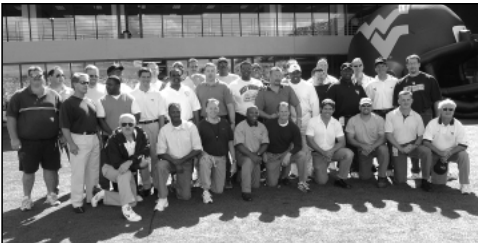
Members of the '82 Mountaineer football team were honored at the WVU-Maryland game on October 5.

The annual Varsity Club golf outing at the Pines Country Club kicked off the weekend on Friday afternoon.